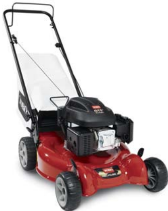
20" Recycler Model 20323 Mower