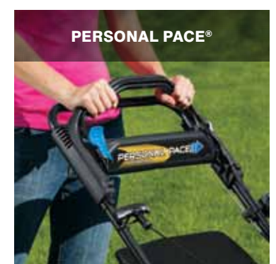
Toro's exclusive Personal Pace system automatically senses and adapts to your walking speed.

Finish mowing faster with a larger 22" cutting width and ground speeds up to 4.5 mph. Our exclusive Atomic Blade efficiently mulches grass — giving you a healthy, lush-looking lawn.