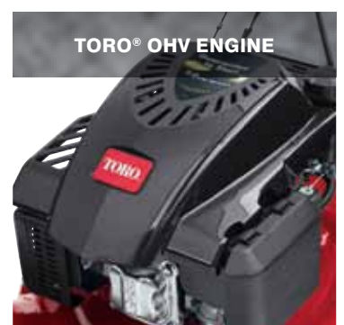
The overhead valve engine is powerful and efficient. It features auto choke — no need to prime, just start the mower and go! Available on select models.