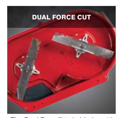
The Dual Force™ twin blade cutting system and Atomic blades cut grass into a super fine mulch for superior quality of cut and a healthy, rich lawn.