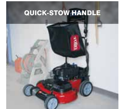
The Quick-Stow handle allows you to position the handle upright for easy, compact storage.

For homeowners with big yards and busy schedules, Toro's new TimeMaster covers more ground in far less time. The sleek, lightweight body easily circles trees and shrubs. The TimeMaster makes a big impact with a small footprint.