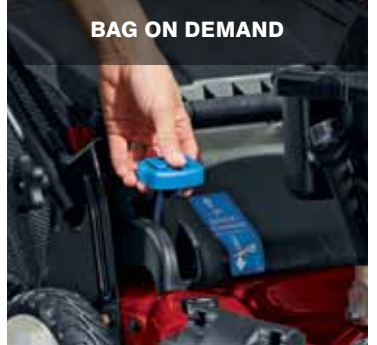
Switch from mulching to bagging in seconds by flipping the quickchange lever.