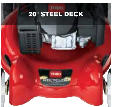
The Recycler 20" cutting deck is lightweight and maneuverable. The smaller width allows for easier mowing in tight areas.

Enjoy the superior cutting and mulching capabilities of our 4" deep steel deck in a lightweight, compact size. This easy-to-use model gives you essential features at an outstanding value and is ideal for smaller, flatter yards.