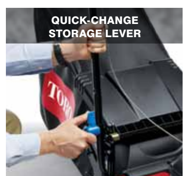
Need to store the mower upright in tight spaces? Just flip the blue levers to raise the handle.