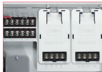
12-station configuration with (2) 4-station modules