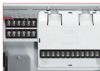
16-station configuration with (1) 12-station module