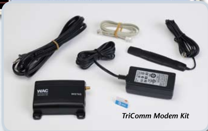
TriComm Modem Kit