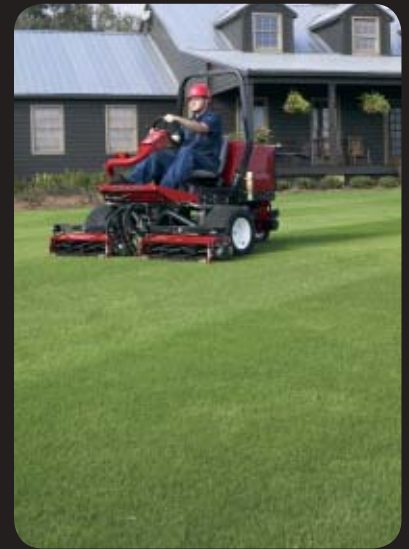
Toro reels deliver a remarkable quality of cut — season after season.

Toro® Reelmaster mowers are lauded for their quality of cut, and the 3100-D is no exception. Your choice of 5, 8 or 11-blade reels let you customize the cutting unit to fit a variety of applications. Variable reel speed adjustment offers even greater operator control while onboard backlapping helps keep blades sharp. All this comes in your choice of 72" (183 cm) or 85" (216 cm) cutting widths to keep you more productive.