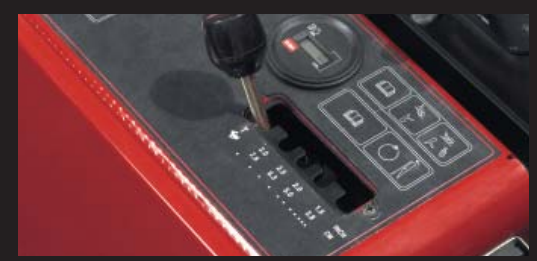
Hole spacing adjusts quickly and easily using a simple lever.

The controls on the ProCore<sup>™</sup> 648 are simple and intuitive, allowing minimal training to get up and running fast. A single switch on the handle controls the tine head and a handle bail engages forward and reverse. No shifting required. Select the desired tine depth and spacing and you're ready to go. Even the comfortable transport speed and forward transport direction are operator-friendly. A fail-safe system stops the machine and lifts the coring head when the handle bail is released for any reason.