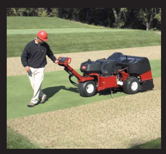
Tires located in front of the aerator never leave wheel ruts that are common on freshly aerated greens, tees and sports fields.

The unique design of the ProCore 648 puts the wheels in front of the aeration head so that you can make pass after pass without running over cores or freshly aerated turf. This prevents damage to the turf and the fresh holes, and makes cleanup easier. Consistently round holes are achieved by the elastomer RotaLink<sup>™</sup> geometry that ensures tines remain vertical as they enter and exit the ground. The individually floating turf holders prevent turf lift when the tines exit the ground to maintain a true and level surface.