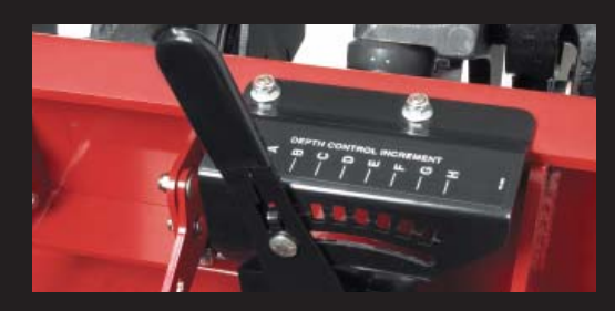
Tine depth is adjustable down to an industryleading 4" deep (10.2 cm).