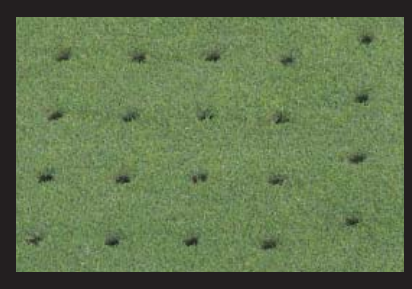
Clean, deep and consistent aeration holes — even on challenging terrain.