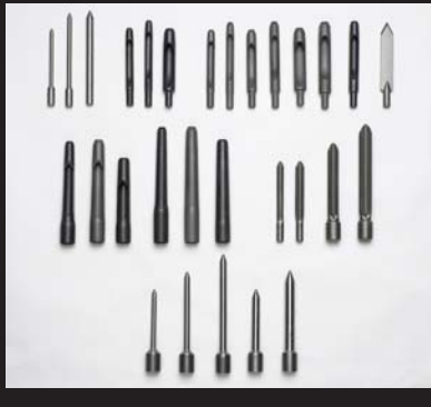
Choose needle, mini-hollow, minisolid, hollow, slotted or solid tines.

An aerator of this quality deserves nothing but the best when it comes to tines. That's why Toro created Titan<sup>™</sup> Tines. They combine a thin wall for superior core quality and a tough carbide tip for maximum durability. Field performance has shown that Titan Tines last up to 3 times longer than regular tines. Combined with the ProCore TrueCore<sup>™</sup> ground following system that maintains tine depth on the fly to match ground undulations, you get consistent coring as deep as 4" (10.2 cm). The patented 3-wheel Series/Parallel<sup>™</sup> traction drive prevents slippage for reliable traction and even hole spacing.