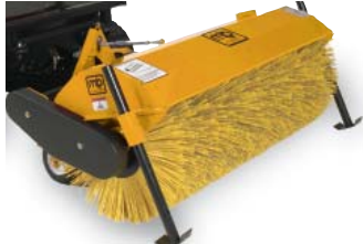
60" (150 cm) Rotary Broom