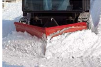
48" (120 cm) V-Plow