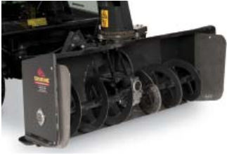
53" (133 cm) Snow Blower