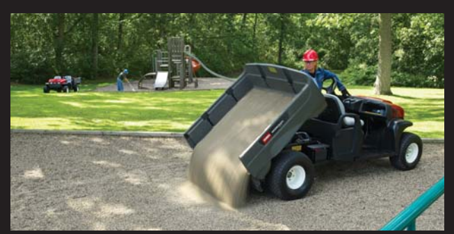
Compared to metal beds that are noisy and can rust, these double-walled polyethylene plastic beds withstand day-to-day abuse and never dent.