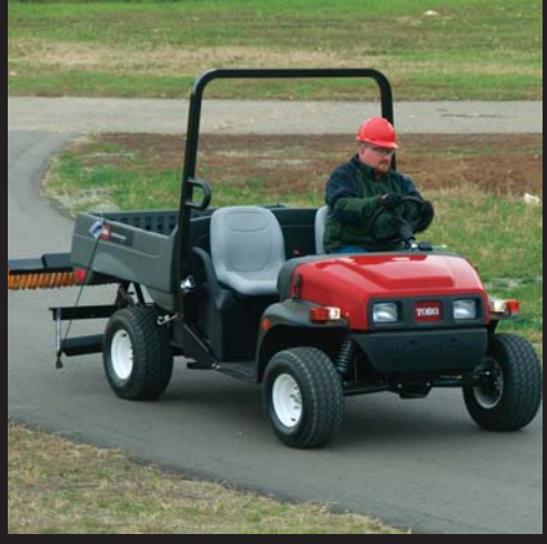
Brake, Tail and Turn Signal Lights