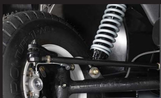
SRQ is one of the most robust suspension systems in the market, allowing you to tackle rougher terrain and get more done.

Operators cannot stop talking about the new SRQ suspension. SRQ represents the Superior Ride Quality you can expect every time you drive a Toro Workman MD Series. The SRQ system starts with coil-over shock absorbers that cushion bumps in the terrain, regardless of your payload. It works together with the proprietary Active In-Frame twister joint that allows each axle to follow ground contours independently. The result is a smooth ride that you and your team will notice immediately. Operators suffer less fatigue and stay more productive throughout the day.