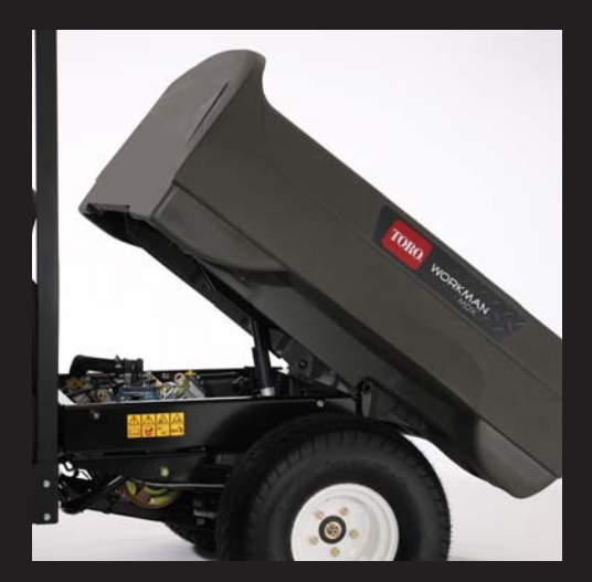
Electric Bed Lift