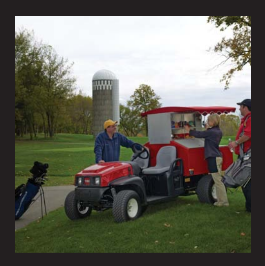
Deluxe Refreshment Center