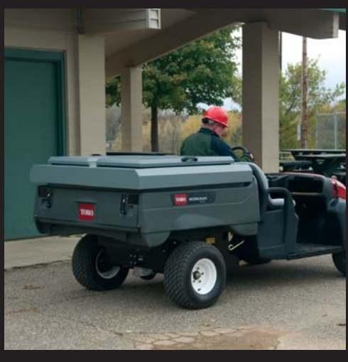
Portable Refreshment Center