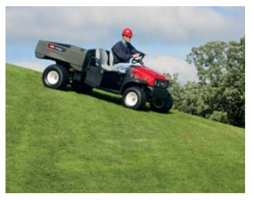
Regenerative braking enhances operator control.