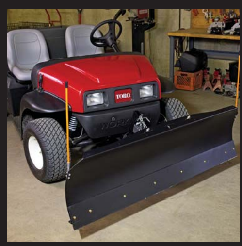
72-inch Snow Plow