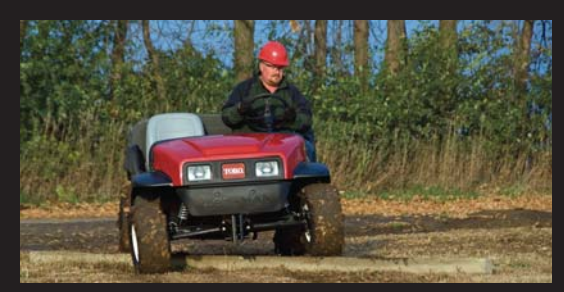
The Active In-Frame twister joint ensure all four wheels maintain contact with the ground for better traction over undulating terrain.