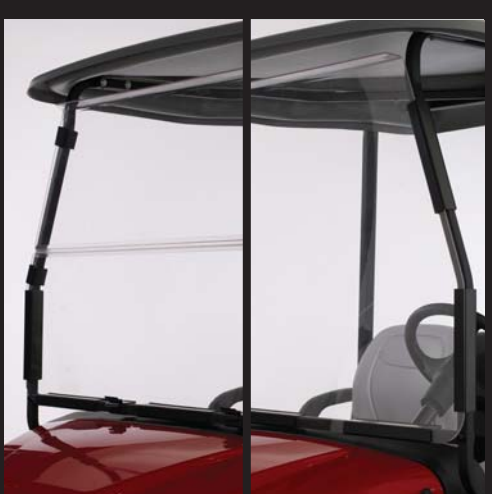
Folding or Solid Windshield