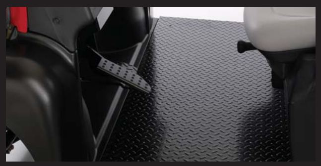
Steel diamond plate floorboards provide a rugged appearance and a durable surface.

When comparing utility vehicles, it all comes down to operator comfort and productivity. That's why, in addition to SRQ, the Workman MD series features a durable plastic cargo bed with a load capacity of up to 1,250 lbs. (567 kg). You'll also have no problem towing equipment to the job site with a towing capacity of up to 1,200 lbs. (545 kg) and the stopping power of four-wheel hydraulic brakes. Whether you're hauling sand or towing equipment, the Toro Workman delivers the power and durability you need.