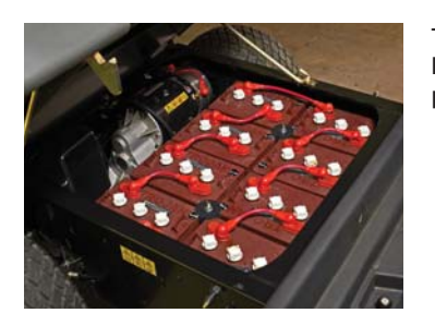
T145 batteries provide longer life for increased productivity.

When you need the power of a Workman with quiet electric performance, turn to the Workman MDE. The SRQ suspension makes driving the MDE easy on the operator. The electric motor allows you to work early in the morning around homes and where quiet performance is a must. The MDE also has 50% fewer maintenance tasks than gaspowered vehicles and emits zero emissions. Save operating costs and enjoy the quiet and powerful performance of the Workman MDE.