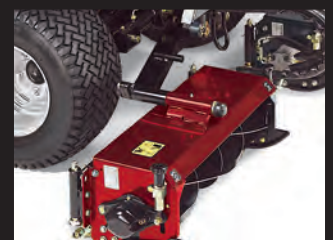
Heavy duty commercial cutting units