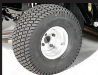
High specification tyres for climbing kerbs