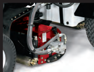
Accessible centre unit for easy adjustment