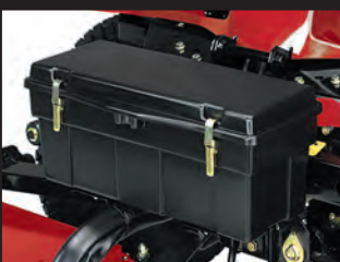
Large toolbox for storage

The option of a fully glazed all weather ROPS certified Cab, gives maximum visibility and a safe comfortable working environment. Air conditioning and heater systems are available, giving the operator added comfort in all weathers. The cab can be tilted forwards to gain access for easy servicing.