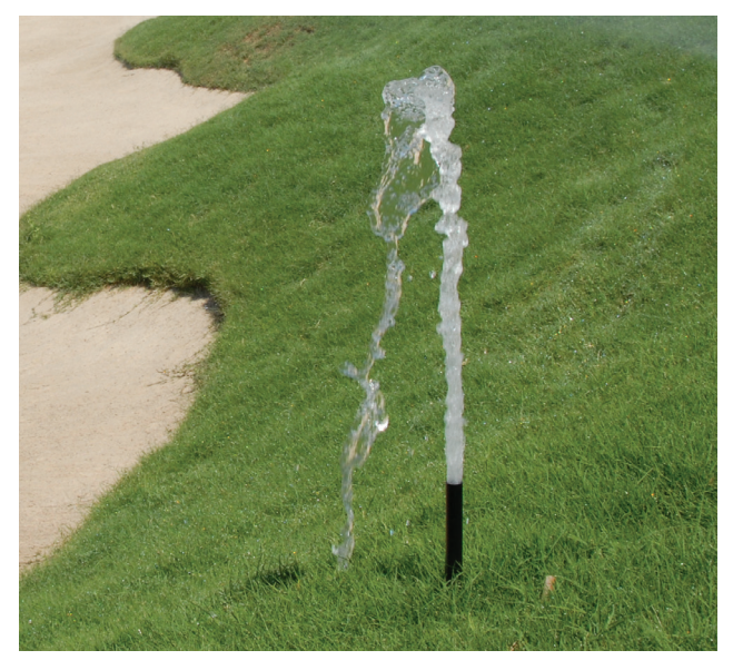
Without X-Flow® Water waste, soil erosion and flooding occur