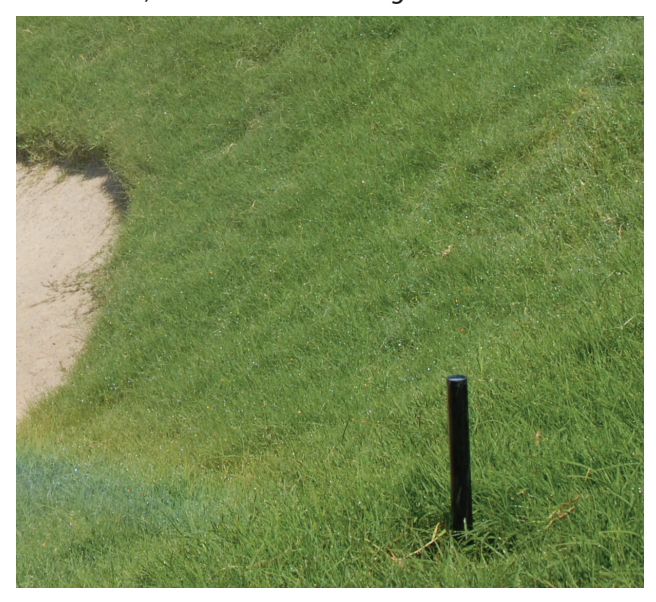
With X-Flow Eliminates water waste, soil erosion and flooding