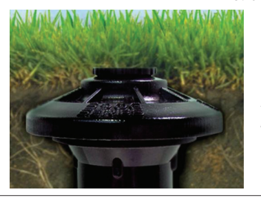
Flanged Cap Flanged cap installs below grade to stabilize the body position and maintain optimum nozzle performance.