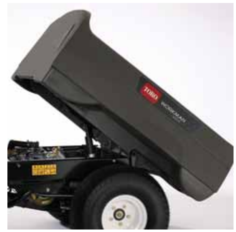
Electric Bed Lift