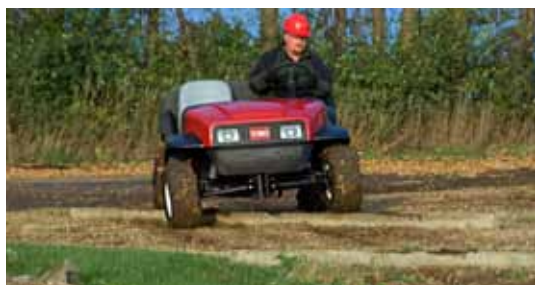
The Active In-Frame<sup>™</sup> twister joint ensure all four wheels maintain contact with the ground for better control over rough terrain.