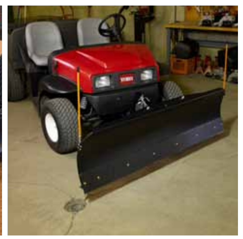
183 cm (72") Snow Plow