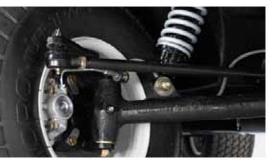
SRQ is one of the most robust suspension systems in the market, allowing you to tackle rougher terrain and get more done.

Operators cannot stop talking about the SRQ<sup>TM</sup> suspension. SRQ represents the Superior Ride Quality you can expect every time you drive a Toro<sup>®</sup> Workman<sup>®</sup> MD Series. The SRQ system starts with coil-over shock absorbers that cushion bumps in the terrain, regardless of your payload. It works together with the proprietary Active In-Frame<sup>TM</sup> twister joint that allows each axle to follow ground contours independently. The result is a smooth ride that you and your team will notice immediately. Operators suffer less fatigue and stay more productive throughout the day.