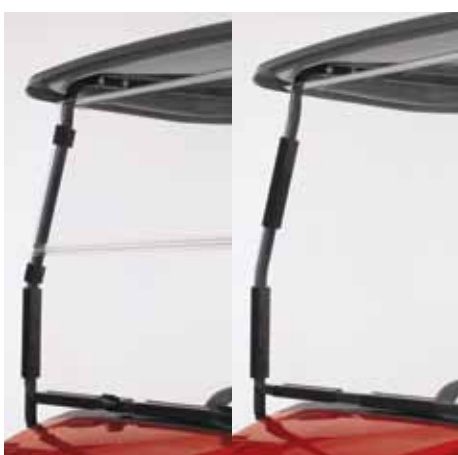
Folding or Solid Windshield