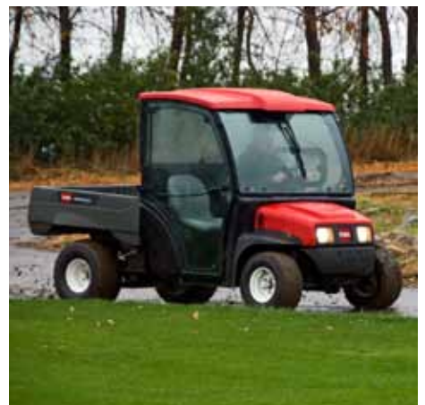
Deluxe Hard Cab

The Toro<sup>®</sup> Workman<sup>®</sup> MD Series adapts to almost any job thanks to a wide variety of all-season accessories and attachments. A deluxe hard cab, canopy top and windshield provide protection from the sun or the elements. The roll-over protective structure (ROPS), brush guard, and heavy duty bumper help you operate in more challenging terrain. Add the deluxe or portable refreshment centre to turn your Workman into a revenue producing machine.