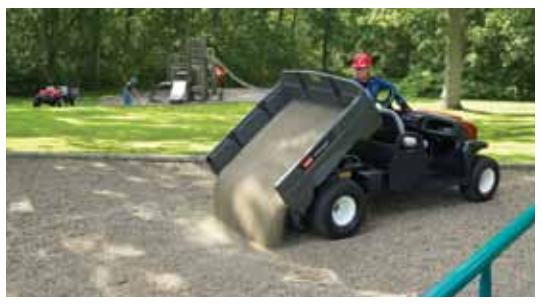
Compared to metal beds that are noisy and can rust, these double-walled polyethylene plastic beds withstand day-to-day abuse and never dent.