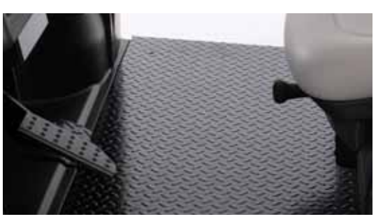
Steel diamond plate floorboards provide a rugged appearance and a durable surface.

When comparing utility vehicles, it all comes down to operator comfort and productivity. That's why, in addition to SRQ<sup>TM</sup>, the Workman MD series features a durable plastic cargo bed with a load capacity of up to 567 kg (1,250 lbs.). You'll also have no problem towing equipment to the job site with a towing capacity of up to 545 kg (1,200 lbs.) and the stopping power of four-wheel hydraulic brakes. Whether you're hauling sand or towing equipment, the Toro Workman delivers the power and durability you need.