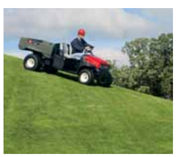
Regenerative braking enhances operator control.