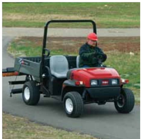
Brake, Tail and Turn Signal Lights